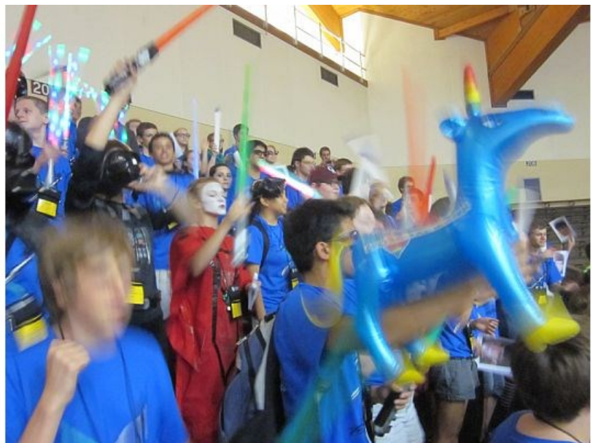
The OJCL delegation is moving at the speed of light in a spirit battle of galactic proportions at National Convention.