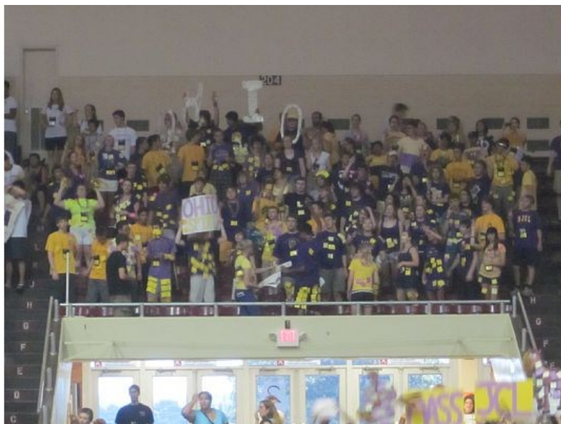
The OJCL delegation showcases their spirit at Nationals.

91 students, 16 Latin teachers (including all 3 state chairs), 2 national committee members, 2 ACLers, 2 adult chaperones, and 15 SCLers journeyed across the river to partake in the annual festivities. The OJCL delega-