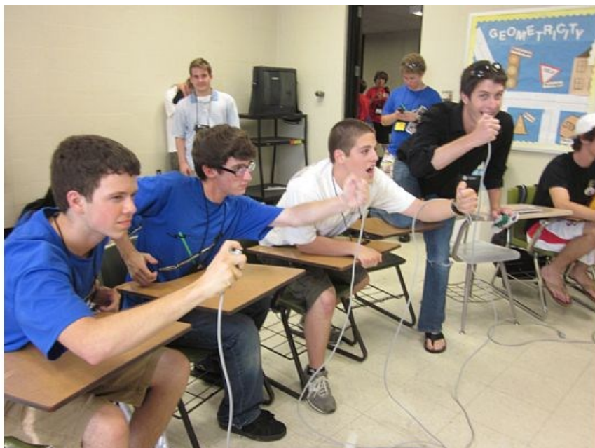
The Ohio Certamen team is ready to buzz! The Upper Level Team placed 9th overall.