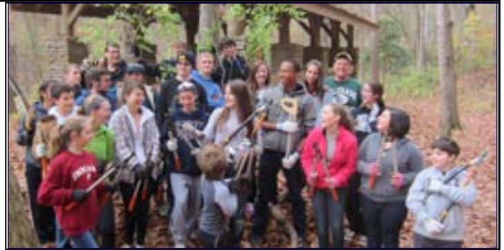
Volunteers with their weapons...er....hedge clippers