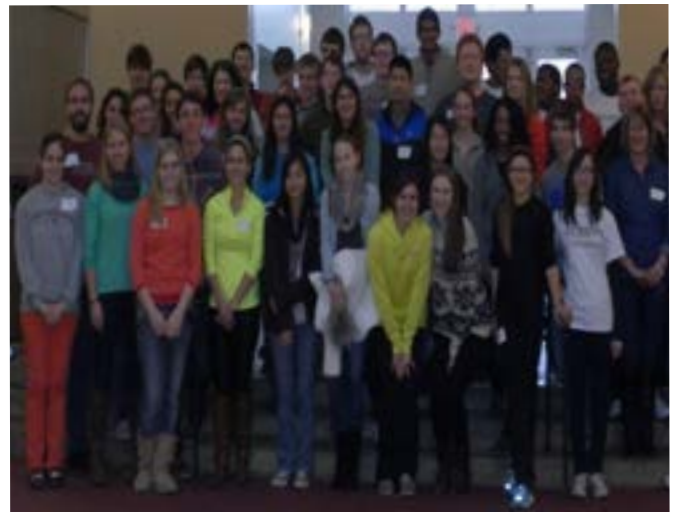
The Project Linus volunteers

Some JCLers will remember the Project Linus service event from last year's convention, which was trailblazing in that it was the first on-site service event we had ever sponsored at an OJCL convention. I am happy to report that, using the blankets and supplies we prepared on MLK Day, we will be continuing this trend by again hosting a Project Linus service event on Saturday at convention. We had such an enthusiastic response to the event last time that we finished the work early and overflowed into multiple rooms. This year we'll expand, and we'll need all the help we can get. There will be more details to come, but be on the lookout for this event on Saturday afternoon. It'll be a great chance to help out the community while meeting other JCLers and enjoying your time at convention. I hope to see you there!