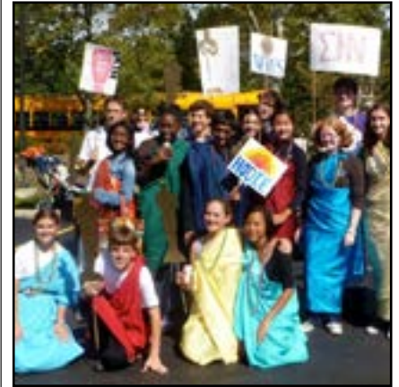
The Shaker Heights Delegation at their Homecoming Parade