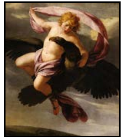
Ganymede, clearly jacketless