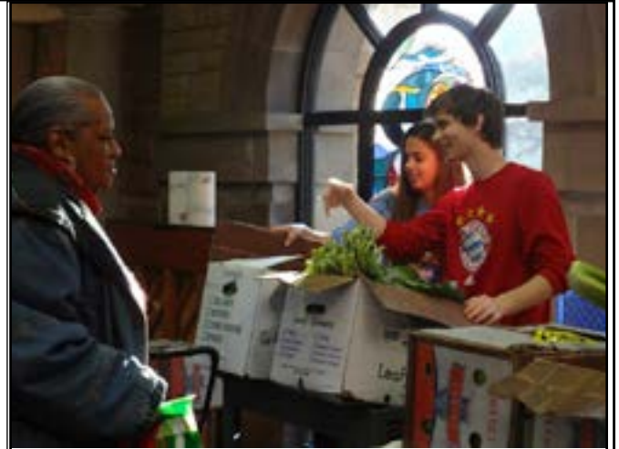
Latinists help a patron

The Latinists of the Central Belt carried boxes, helped patrons, sorted several thousand variations of cranberry sauce, and handled over 5,000 pounds of surprisingly wet produce. Ultimately, it was a beneficial endeavor for all. Some 1,000 hungry citizens of the Columbus area were able to return to their homes laden with goods for delicious and healthy Thanksgiving dinners. And that says nothing about the worthwhile experience for us. It was fantastic to be able to interact with people outside of our daily routine, and it gave us a new perspective on what we had to be thankful for during that time of year. After all, in the wise words of the preeminent classicist Goethe, "he who does nothing for others does nothing for himself."