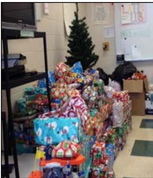
The pile of gifts after the successful giftwrap!