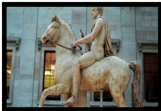
Caligula's Horse Incitatus

As you may know, a well-known and valued part of Convention are the Colloquia Sessions. These can range from studying aspects of the Roman religion, to analyzing how the modern movie industry still uses classical themes taken out of Greek and Roman traditions. However, there are those colloquia sessions that are deemed unwelcome by the professional focus groups. To know what you're missing, check them out!