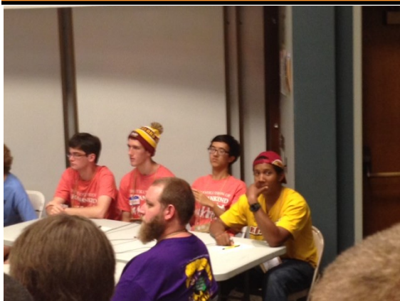
Upper Level Certamen Team at NJCL convention 2014