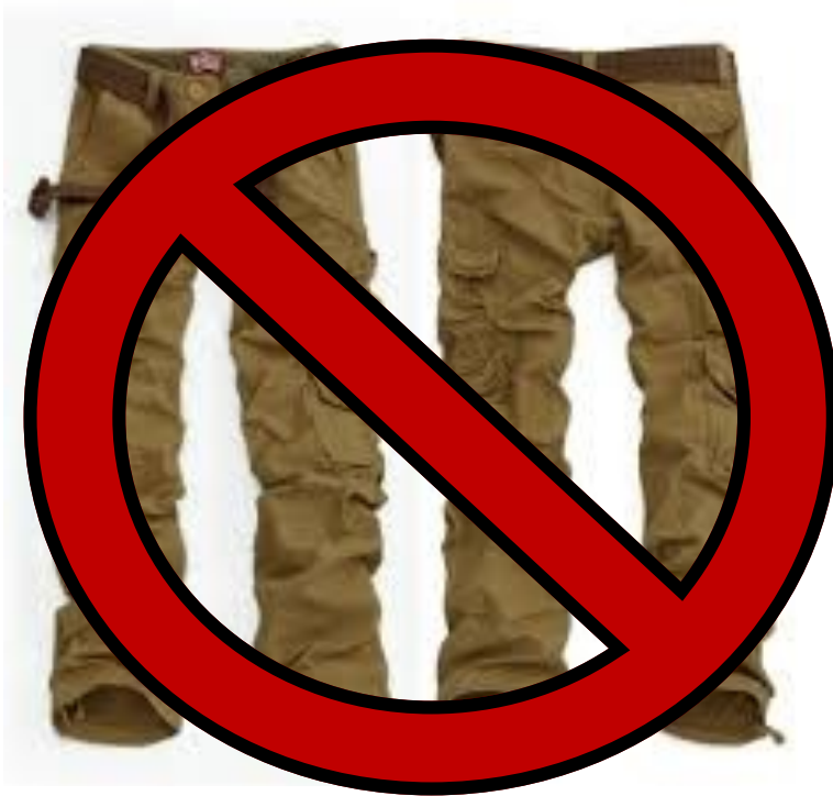
The Dreaded Cargo Shorts.....

Many will consider themselves “frat” by wearing a long sleeve shirt with cargo shorts. However, they are sadly mistaken. The presence of the cargo shorts only lowers their