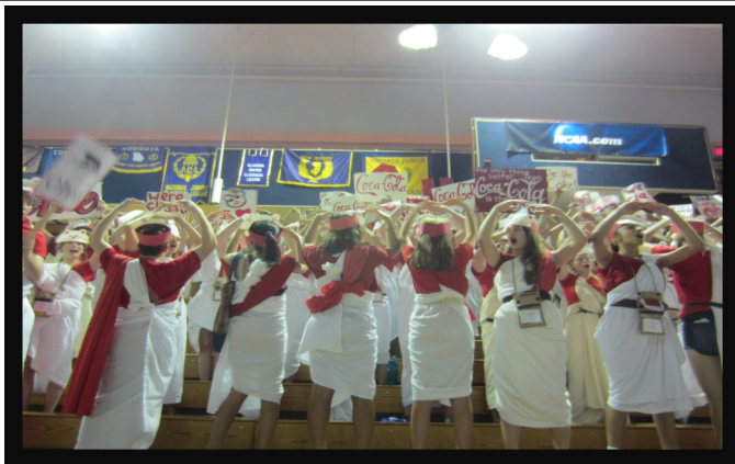
OJCL Delegation at Nationals