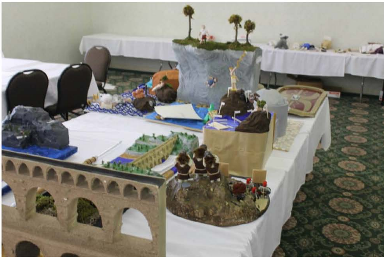
Some of the lovely projects that were on display at this year's Ohio Junior Classical League Convention!