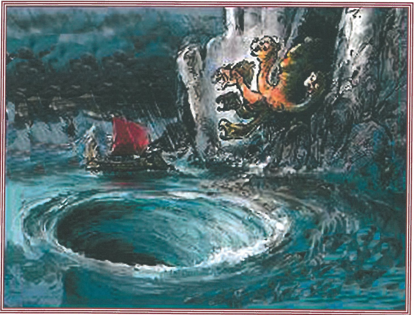
In this painting, Odysseus' ship approaches the strait with the whirlpool Charybdis and the monster Scylla.