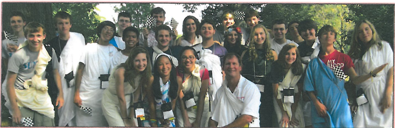
The Summit Students at the 2012 NJCL

The talent and variety show called ‘That’s Entertainment!’ was the big event tonight. The omniscient, omnipotent, omnipresent, and indispensable SCL hosts the show, and the JCL supplies the talented acts. Only 12 of 53 acts made the show. The Racketeers made their usual appearance, but I fear it is their last. For the first time ever, they removed the racket covers from their heads, and I take this as their parting ‘ave atque vale.’ There were some good Olympic spoofs, a time traveling van in the officer skit, and a very compelling drag race.. It was top rate entertainment.