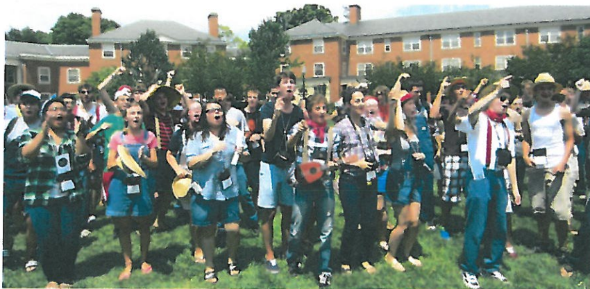
The OH delegation challenges WI to a Spirit Contest outside Wait Chapel.