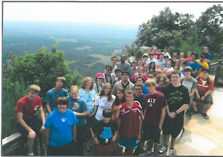
Students on Pilot Mountain overlooking the Piedmont region

It was 8 hours of driving with a rest area stop, a lunch break (pretty much Wendy's or Subway), and a 2 hour visit to the Pilot Mountain State Park. We arrived on campus at 5, were settled in by 6, had eaten by 7, and had the rest of the evening to play pick-up ultimate or connect with old friends or meet new friends or kick the hacky-sack or play Ninja or watch Disney's 'Hercules.' OH met for its nightly fellowship meeting at 10:30, and students were all in their rooms – some going to sleep and others clearly not – by 11:45. Convention formally begins tomorrow with the 1st General Assembly at 1 pm.