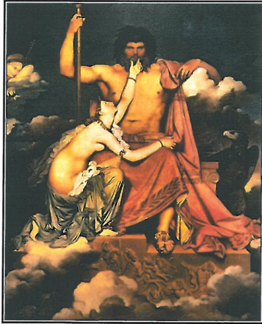
Thetis begs Zeus to honor her son Achilles, who has refused to fight for Agamemnon and the Greeks. Zeus grants her request and gives the Trojans (temporary) victory on the battlefield.

Over two-thirds of Summit students earned an award this year.