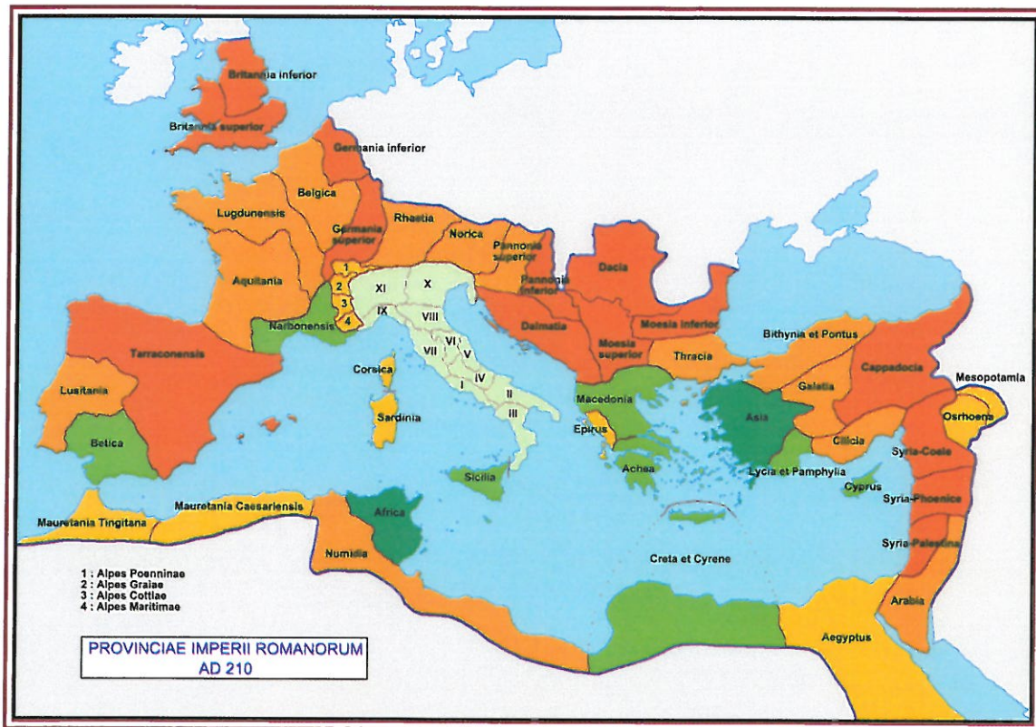
The Provinces of the Roman Empire & 10 Regions of Italy

One-Third of Summit 6 th graders earned an award!