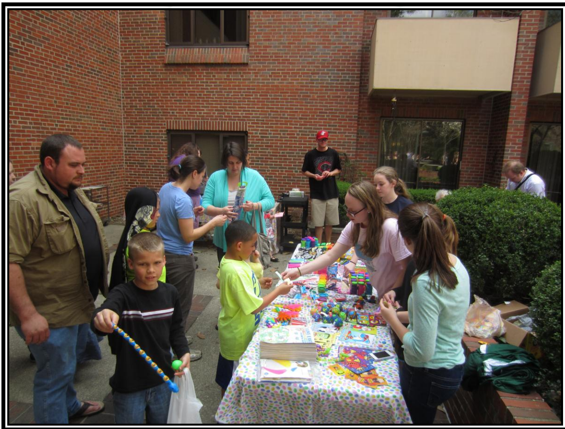
Summit Latin students hand out prizes to kids for the eggs they found during the hunt.