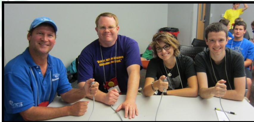
It was all smiles during the Prelims.