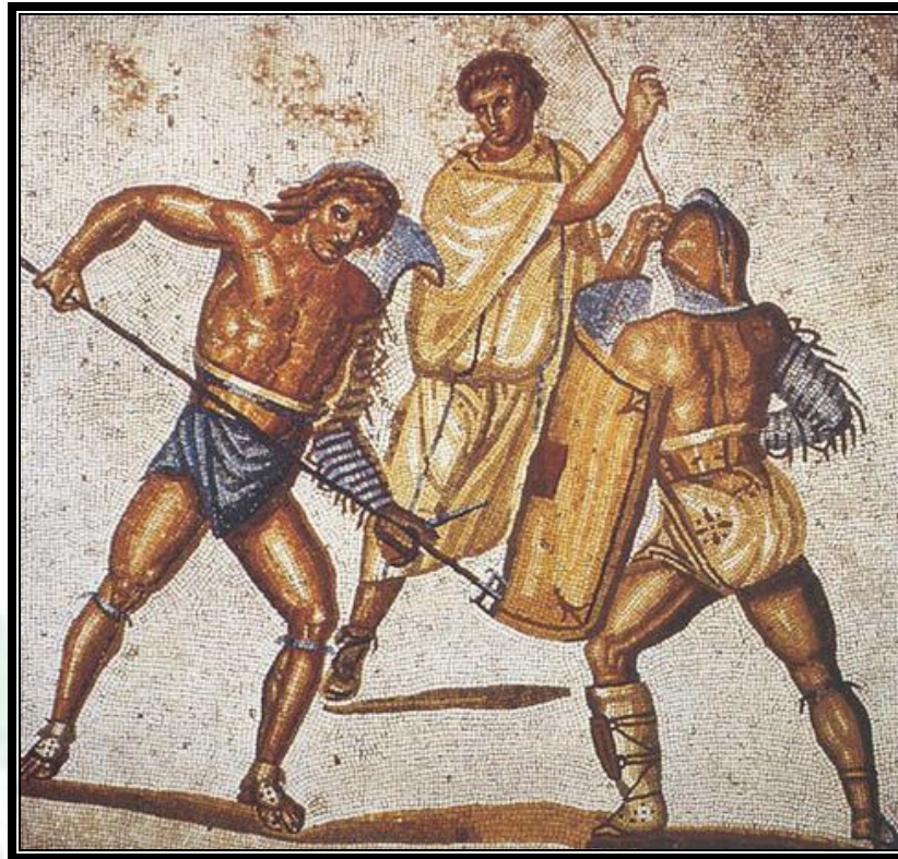
This mosaic of a gladiatorial match shows a retiarius (with the trident) vs a secutor (with the shield & helmet). The man in the middle with the staff is the referee of the match.

Over 45% of Summit 6 th graders earned an award!