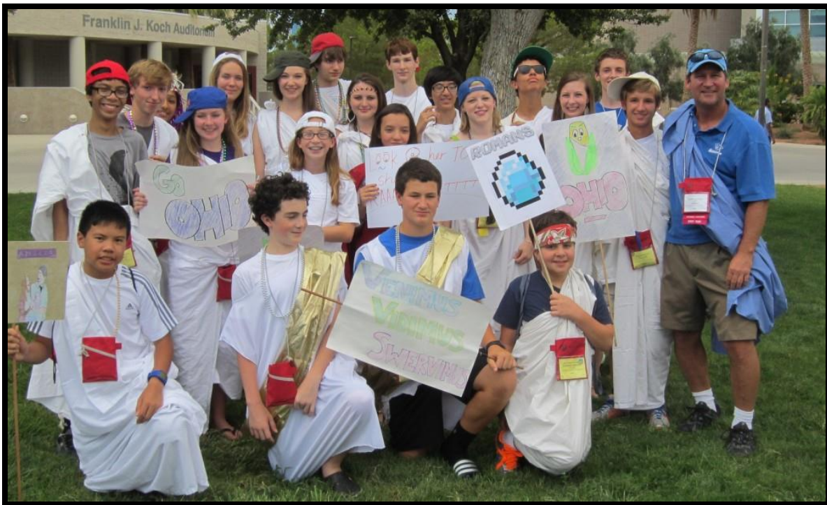
The Summit Group during the Toga Parade