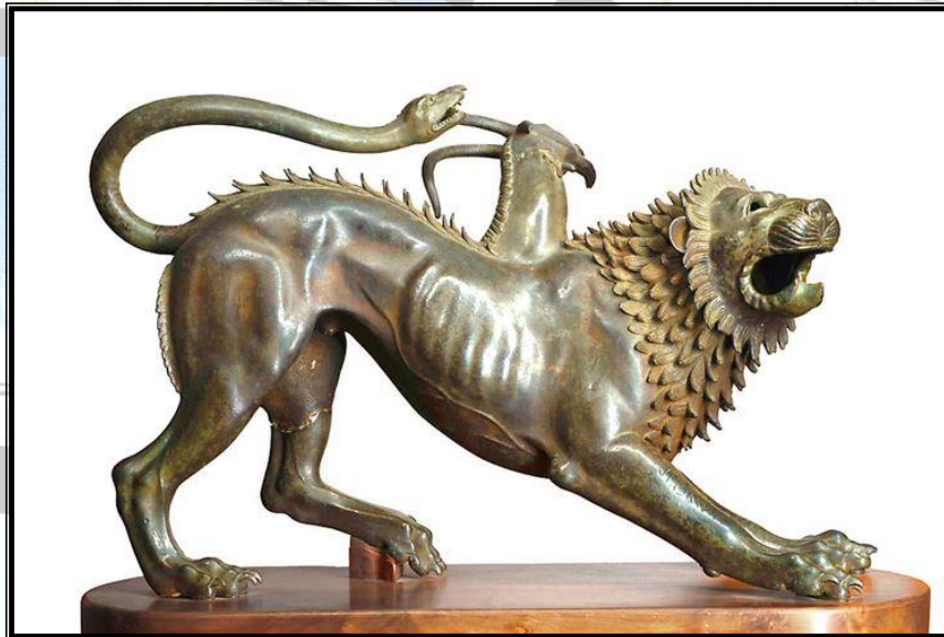
The Etruscan bronze 'Chimera of Arezzo' (c. 4 th century BC) was part lion (leō), part snake (serpens), and part goat (capra). It was killed by Bellerophon & Pegasus, part horse (equus) and part bird (avis).

One-quarter of Summit students earned an award this year.