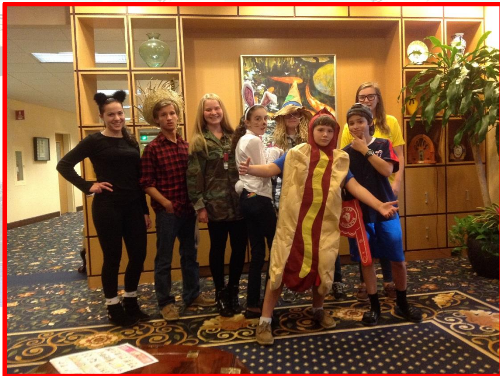
Summit Latin students in Halloween costumes at Lee Retirement Home.