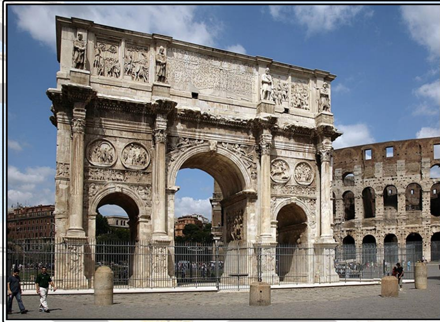
The Arch of Constantine is located next to the Colosseum.

44% of Summit 6 th graders earned an award!