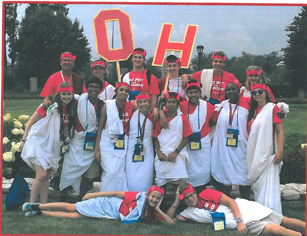
The Summit Delegation at National Convention – 'pig' was the theme of the day!