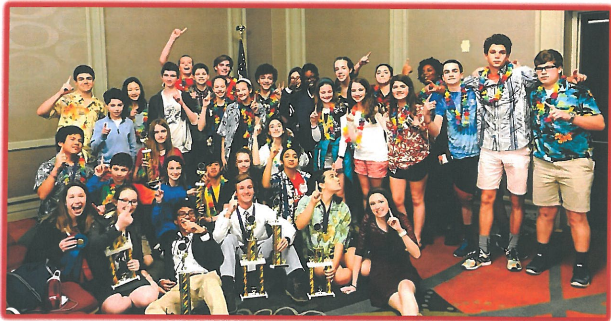
Summit Latin: #1 Overall at the State Convention!