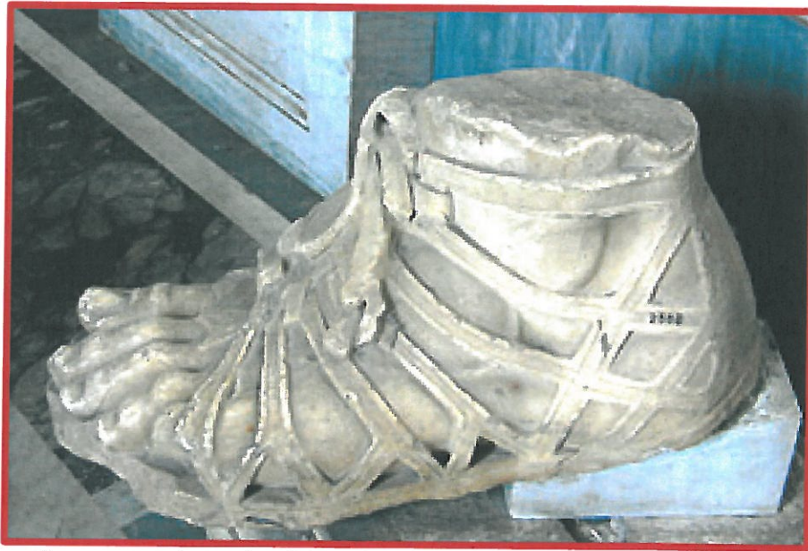
Statue fragment of a solea (Roman sandal) from the Roman Imperial period.