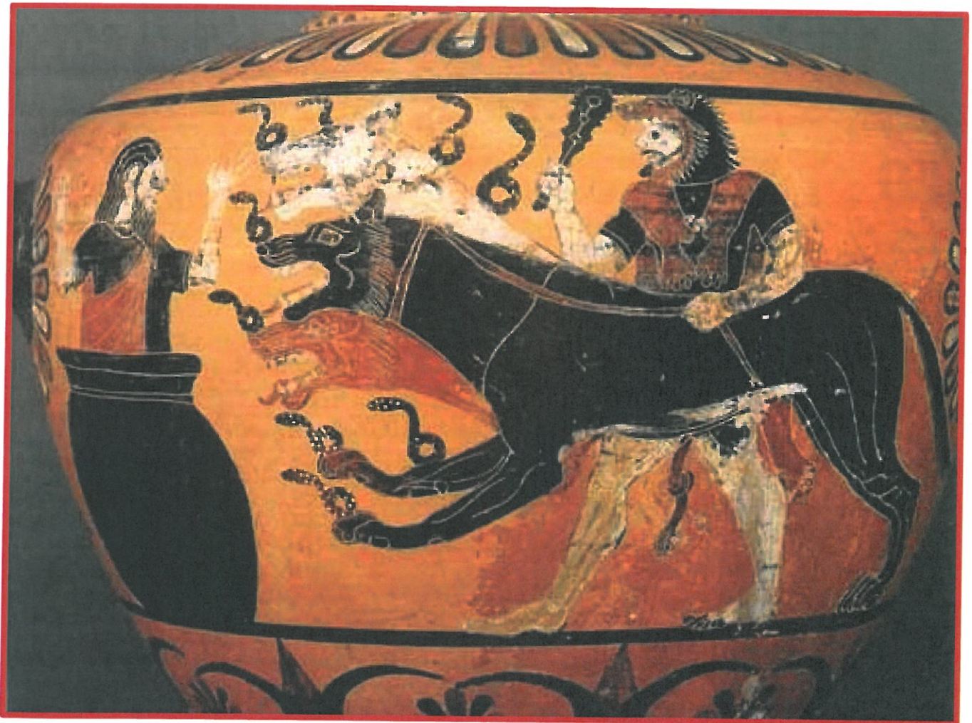
Heracles shows the hydra-like Cerberus to Eurystheus, who hides in a storage jar (6 th century BC vase from Etruria)