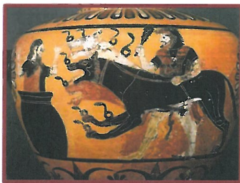
Heracles shows the hydra-like Cerberus to Eurystheus, who hides in a storage jar (6 th century BC vase from Etruria)