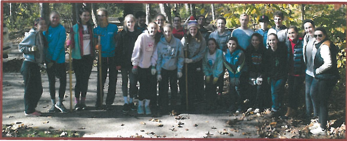
Make a Difference Day at California Woods (above); Halloween & Easter at Marjorie P Lee (below)