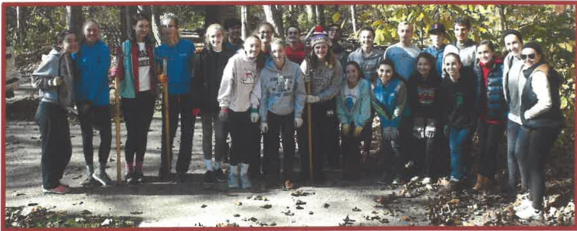
Make a Difference Day at California Woods (above); Halloween & Easter at Marjorie P Lee (below)