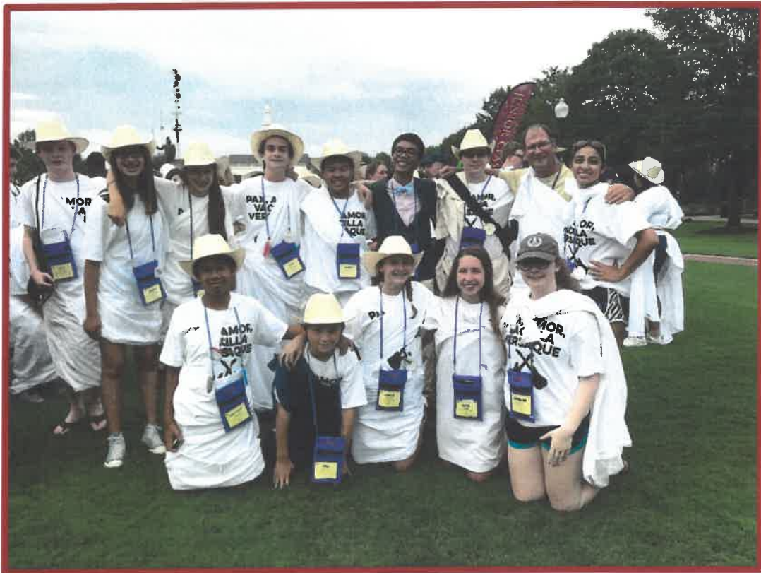
The Summit Delegation at NJCL!

Twelve Summit Latin students attended the National Junior Classical League convention at Troy University (AL) from July 25 to July 29. Over 1,600 students, teachers, college students, and chaperones from 40 states participated in the 64 th annual gathering hosted by the NJCL, the national organization which promotes the study of Latin in secondary schools. The NJCL has over 1,200 chapters and over 48,000 students. The convention is filled with a variety of competitions and activities including academic tests, art contests, live performances, a talent show, a toga parade, and more.