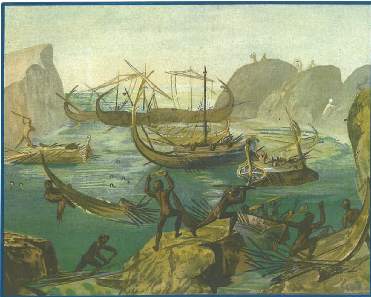
This drawing is based on a famous fresco which depicts the Laestrygonians destroying Odysseus' fleet and killing most of his men.