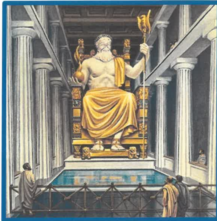
Reconstruction of the Statue of Zeus at Olympia:

Zeus, in ivory and gold, seated on his throne, with a scepter in one hand and winged Nike in the other.