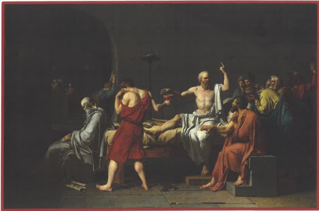
'The Death of Socrates' (Jacques-Louis David, 1787)