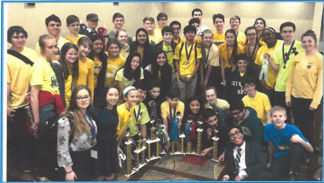
Summit Latin: #1 in Academics at the State Convention!

All the Certamen teams won their semi-final matches and earned the right to compete the Finals on the 'Big Stage':