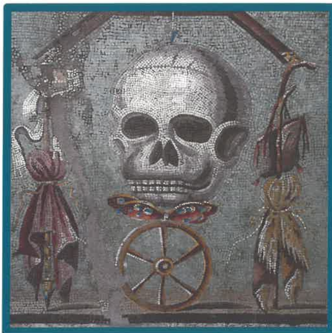
Mosaic from Pompeii with a 'memento mori' (remember to die) theme