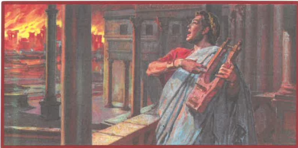
This painting depicts the scene of 'Nero fiddling while Rome burned.'