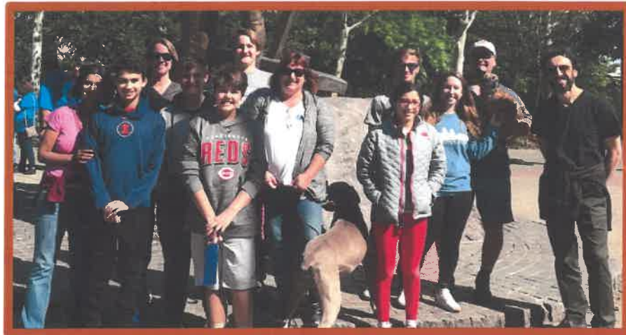
Walk for Suicide Prevention (above); Matthew 25 (below)