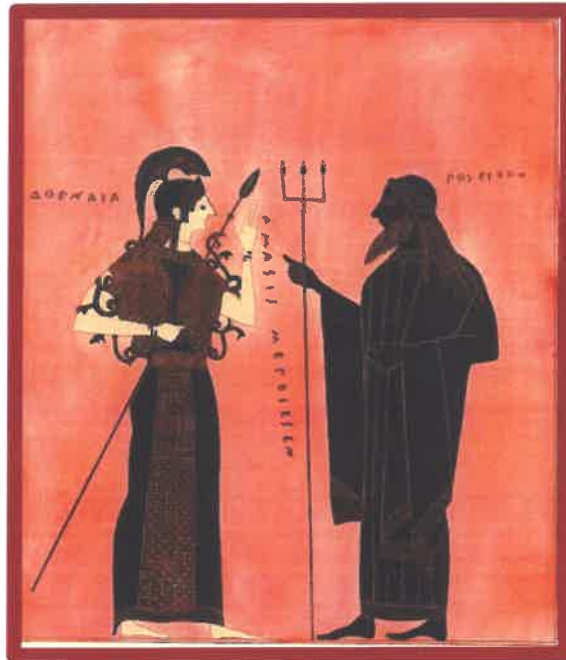
This Greek black-figure vase painting shows the contest between Athena and Poseidon for the patronage of Athens.

26% of Summit students earned an award this year.