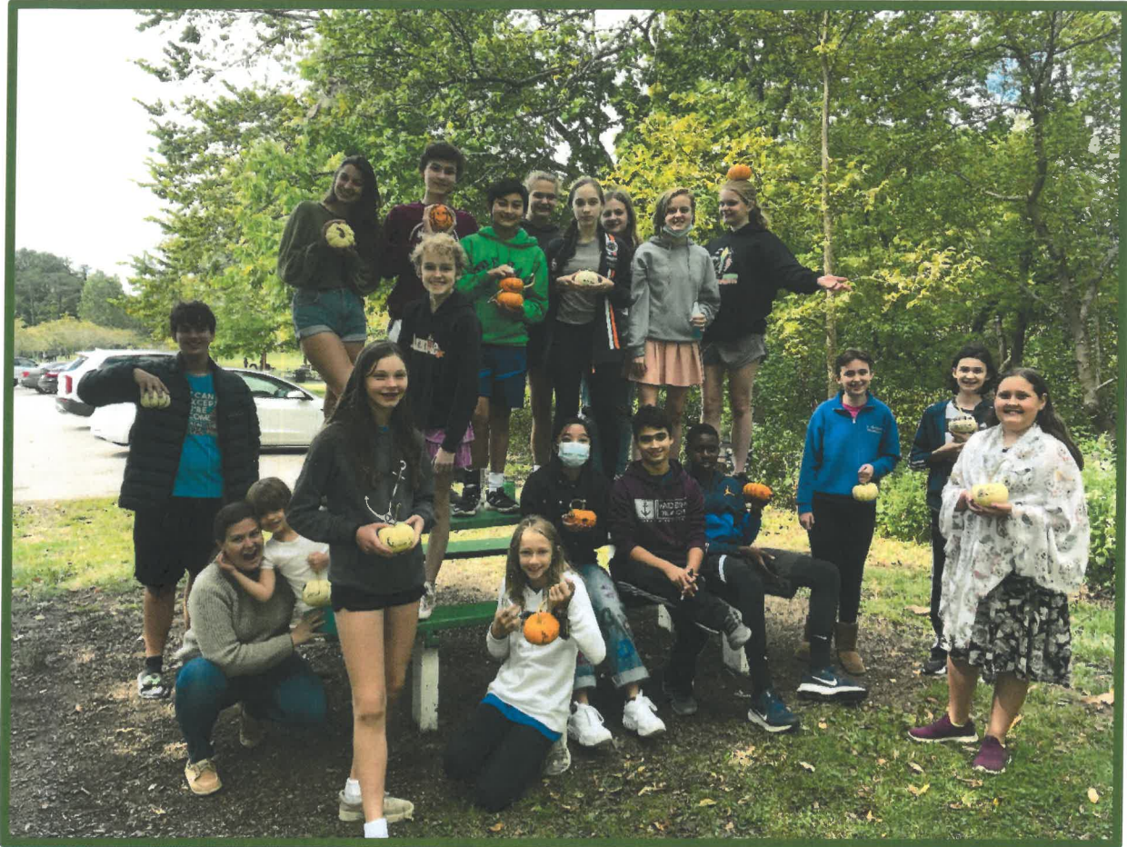
Fall Picnic: Mythological Pumpkins and The Pizzas That Arrived Too Late!