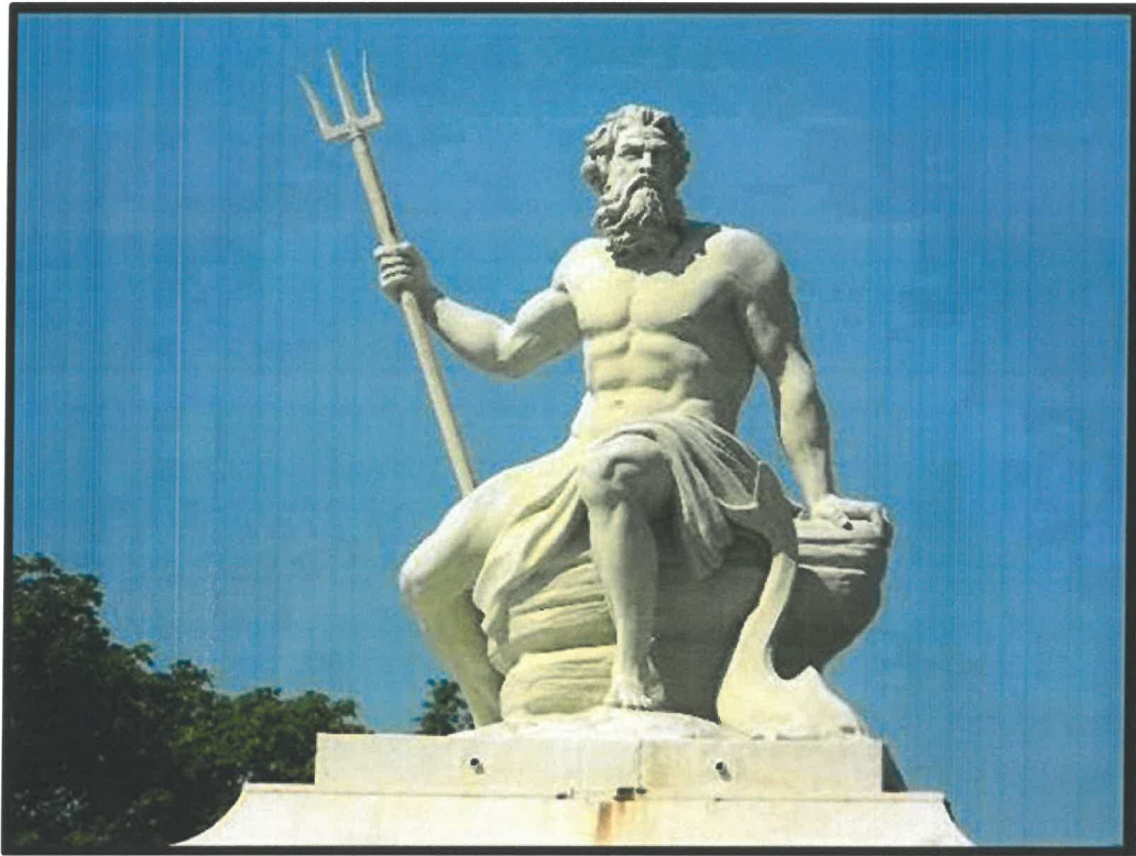
Poseidon with his trident

The Pegasus Mythology Exam is a multiple-choice test given every February to over 6,000 middle school students from over 300 schools across the United States. This exam includes the origins of the classical gods, the rule of the Olympians, and a special section on Theseus, the Greek hero who killed the Minotaur and became the King of Athens.