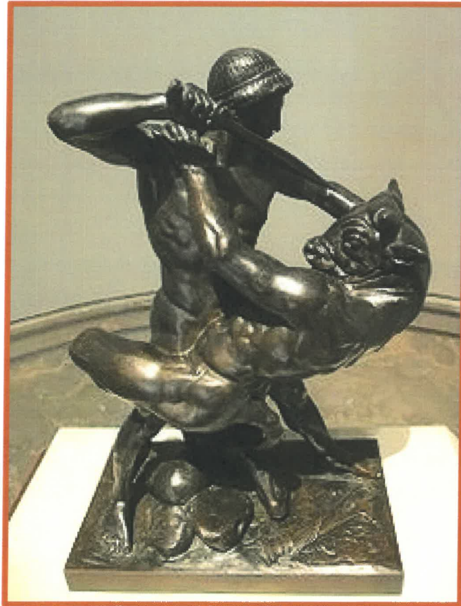
Theseus and the Minotaur

59% of Summit 7 th and 8 th graders earned an award this year.