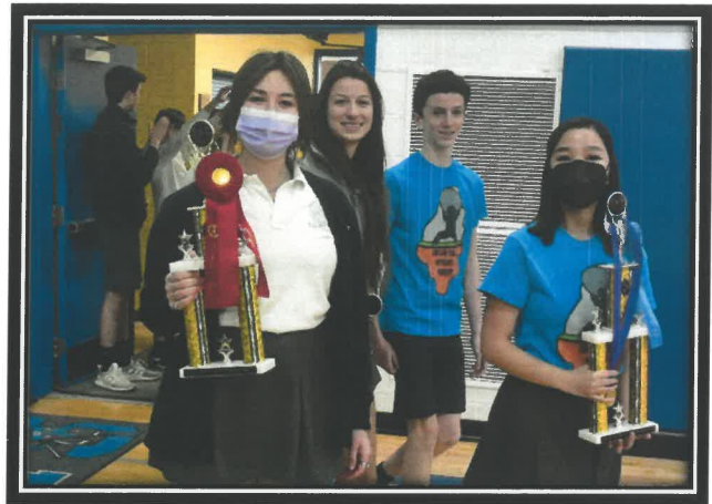
Convention: Wali/Ana, State Celebration, Summit Banner, 7th Graders!!