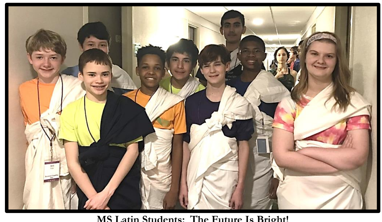
MS Latin Students: The Future Is Bright!

These students placed in the top 15 out of all 350 students at convention.