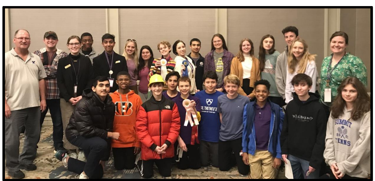
The Summit Latin Team: 2023 Overall Points Champion!

The victory was a result of a consistent effort in all areas of competition: contests submitted before convention, creative arts performed at convention, graphic arts like models and mosaics, electronic competitions like the digital scrapbook and music video, and academic tests like derivatives and mythology. Other activities included general assemblies, a toga banquet, a Jeopardy-style game called certamen, a talent show, elections, service projects, and more.