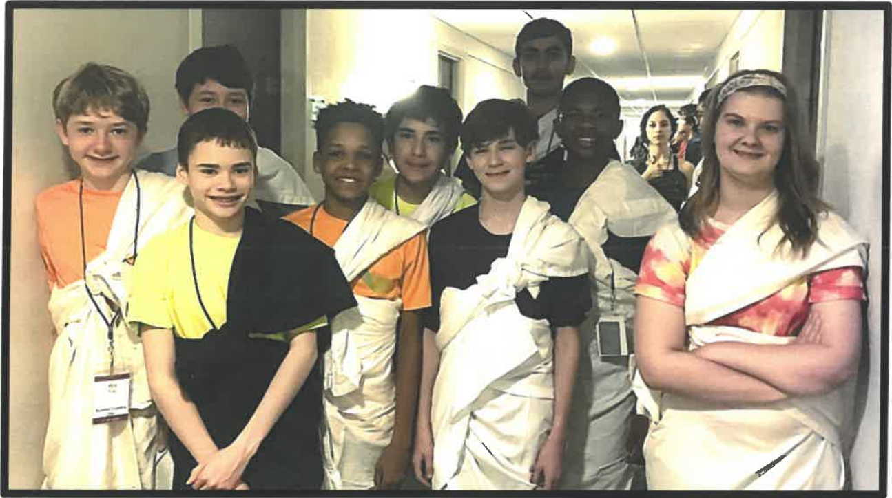
MS Latin Students: The Future Is Bright!

These students placed in the top 15 out of all 350 students at convention.