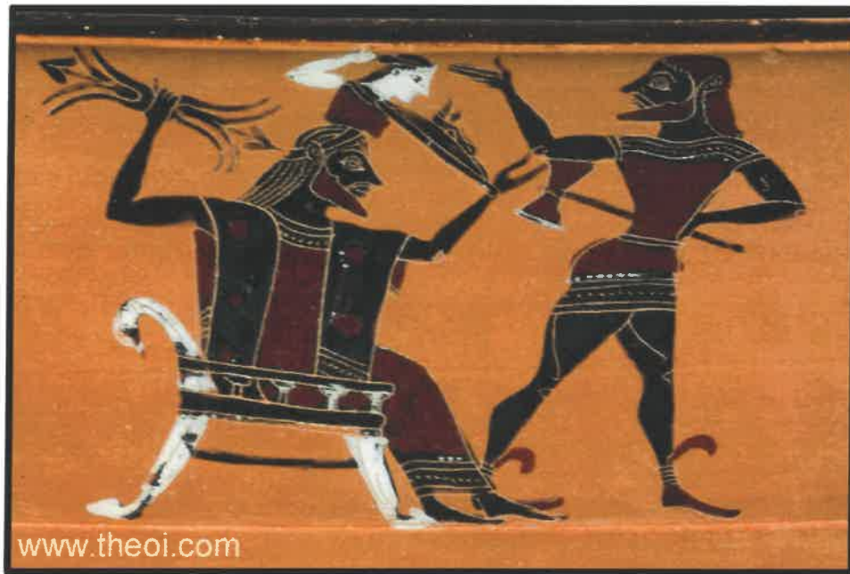
In this vase painting, Athena is born from Zeus' head, with the help of Hephaestus.

The Pegasus Mythology Exam is a multiple-choice test given every February to over 5,000 middle school students from over 300 schools across the United States. This exam includes the origins of the classical gods, the rule of the Olympians, and a special section on Jason & the Argonauts, the group who went on the quest for the Golden Fleece.