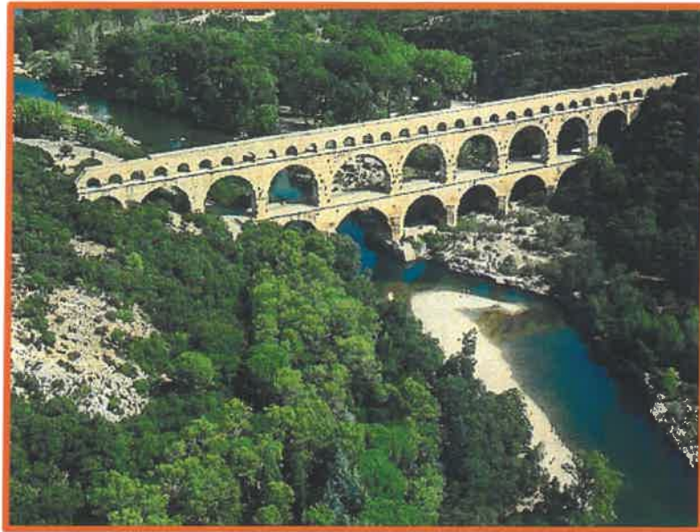
Ancient Roman aqueduct, Pont du Gard, France

Over 300 students took the online Hellenic Civilization Exam . It was a 50 question, multiple choice exam on all aspects of ancient Greek language, culture, history, and literature. Over 13% of Summit students earned an award.