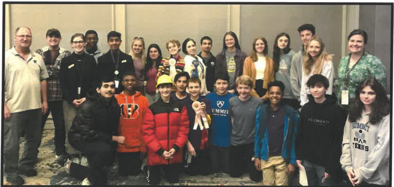
The Summit Latin Team: 2023 Overall Points Champion!

The victory was a result of a consistent effort in all areas of competition: contests submitted before convention, creative arts performed at convention, graphic arts like models and mosaics, electronic competitions like the digital scrapbook and music video, and academic tests like derivatives and mythology. Other activities included general assemblies, a toga banquet, a Jeopardy-style game called certamen, a talent show, elections, service projects, and more.