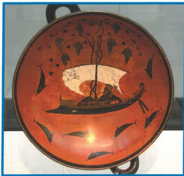
Dionysus changed pirates into dolphins.

60% of Summit students earned an award this year.