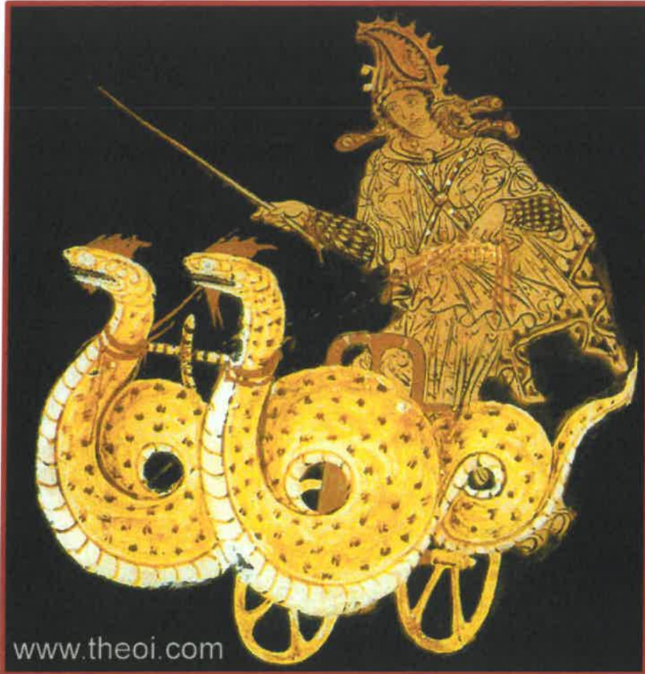
In this vase painting, Medea – after causing the death of Jason's new bride – escapes on a serpent-drawn chariot.

63% of Summit 7 th and 8 th graders earned an award this year.