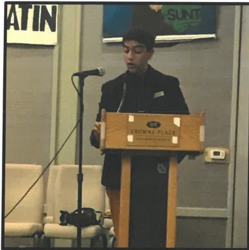
Parliamentarian Wali Khan