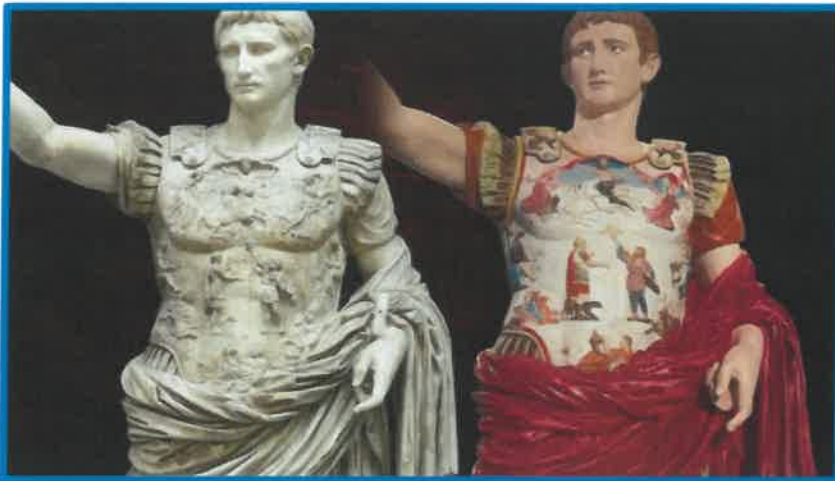
Augustus wrote a memoir called the Rēs Gestae (My Accomplishments), which made him look pretty good. This is the statue of Augustus Prima Porta, and – like many statues – it was originally painted.