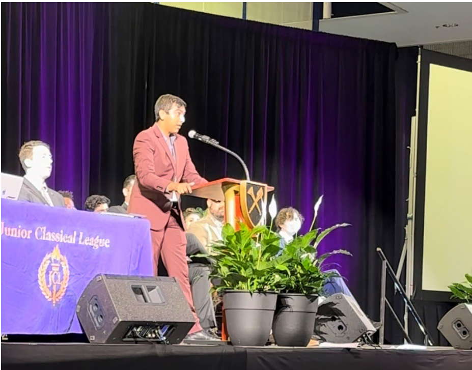
Wali addressing the convention at the close of GA III