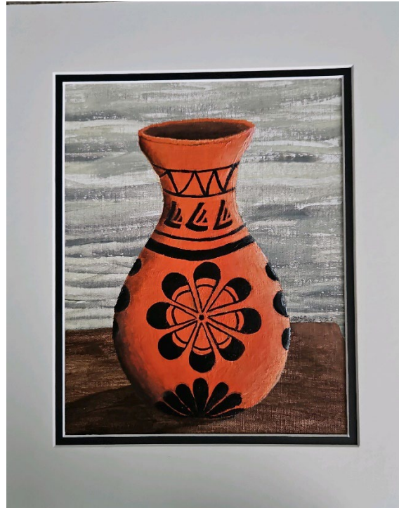
Kori's 1 st place Watercolor and 3 rd place Mixed Media