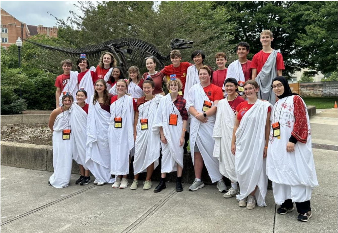
(Most of the) Ohio Delegation on Toga Day at our dinosaur meeting spot!