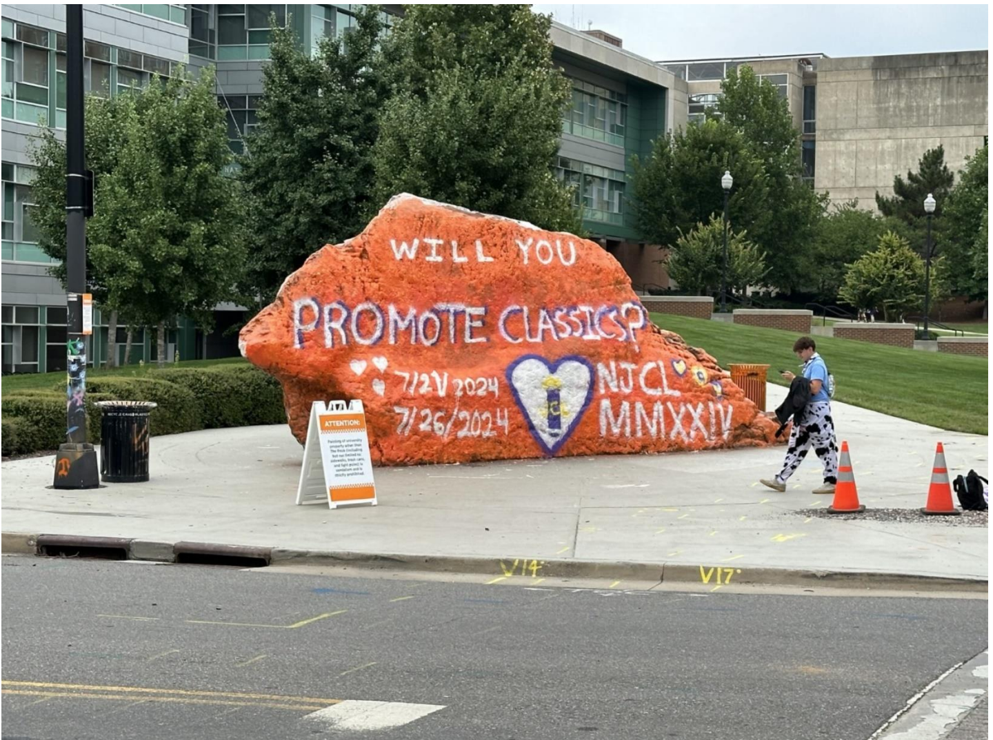
NJCL painted Tennessee's 'ROCK-y Top' to celebrate our fun week on campus